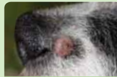
Skin lump on the nose of a dog

If you do discover a lump on your pet, it is very important that we examine it as soon as possible in order that we may establish the underlying cause and start any treatment without delay. Timing is everything and delay in appropriate treatment can be the difference between a small mass that is easily treatable by surgical removal and one that is far more difficult to treat. So if you are concerned about a lump on your pet – or any other health problem, please contact us today for an appointment.