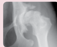
X-ray of an arthritic hip joint in a dog. The symptoms of arthritis are often much worse in overweight pets.