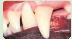
(1) Healthy mouth